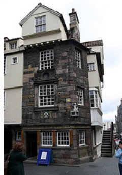
John Knox Home - Edinburgh, Scotland

Painting and minor repairs on the Solid Rock Church – Drogheda, Ireland